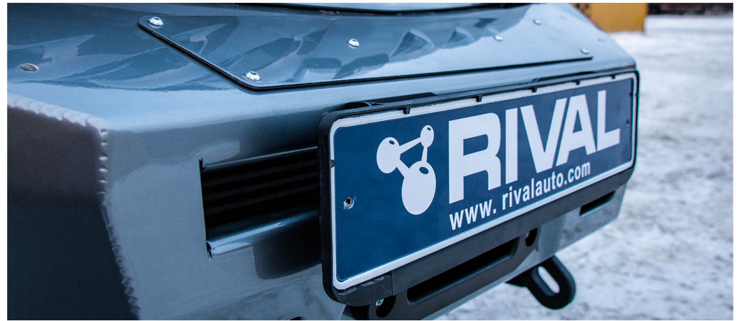
Equipped with convertible license plate frame that provides easy access to the winch Installation of winch up to 12 000 lb.